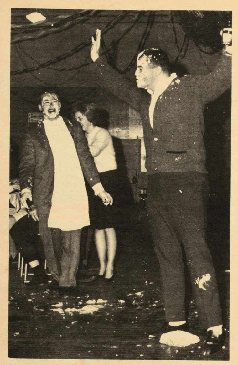
All right fellows: "GLORY, GLORY FOR DA. . . " FOOTBALL TEAM SHOWN AT A RECENT OFF-GRIDIRON PARTY TO DIS-CUSS TACTICS FOR THE