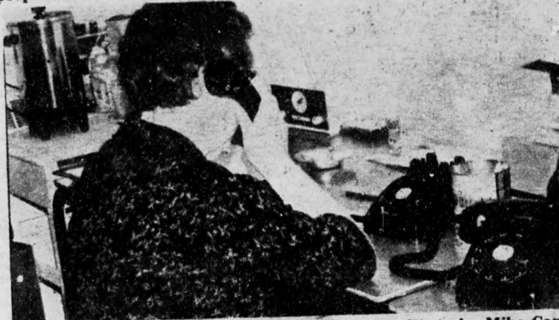
Chimo volunteer mans the phone.

Chimo's hours are from 9 a.m. - 1 a.m. and can be called at 455-9464.