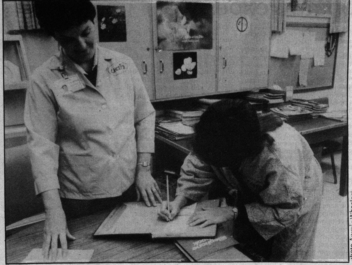
Volunteer working in library in main hospital with patient.

Deadline for Applications: 4:00 p.m. Wednesday, October 16, 1983