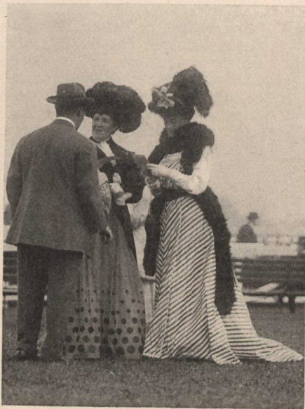
At the Woodbine.

Hostess. "I asked him to a progressive euchre party last winter and he did not even answer the invitation. Of course I won't ask him again."