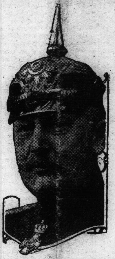
General von Moltke, Commander-in-Chief of the German forces.

"Twelve million men in God's image Sentenced to shoot and be shot, Kill and be killed, as a ruler has willed, For what? for what? for what? —AUCH.