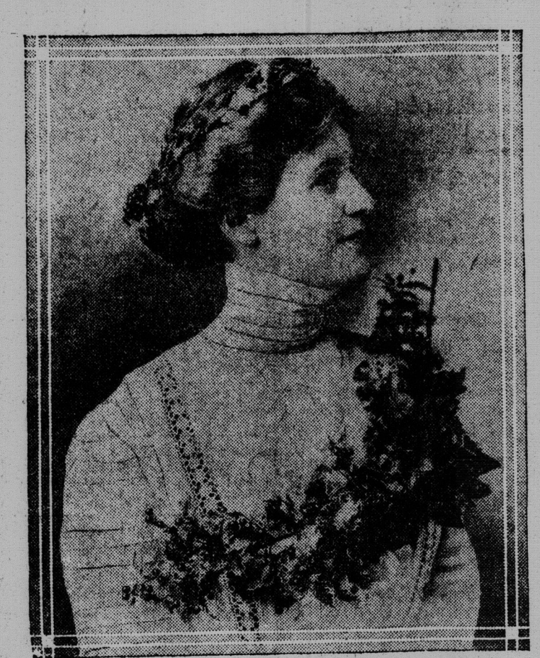
NEW LINGERIE BLOUSES ARE MADE OF FINE VOILE