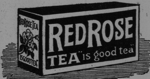
Red Rose Coffee is as generously good as Red Rose Tea

In the sealed package, you get not only full weight, but full flavor, full strength and all the good qualities of Red Rose Tea protected against the air, odors and dust.