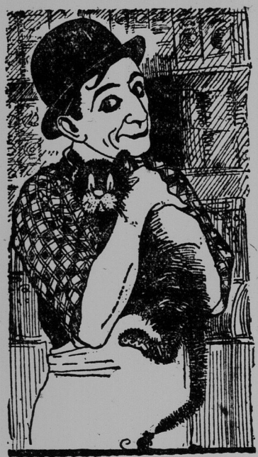
See This Cat Do the Shimmy Dance

—BE EARLY— PRICES—Matinee, 10c.—15c. Evening, 15c.—25c.