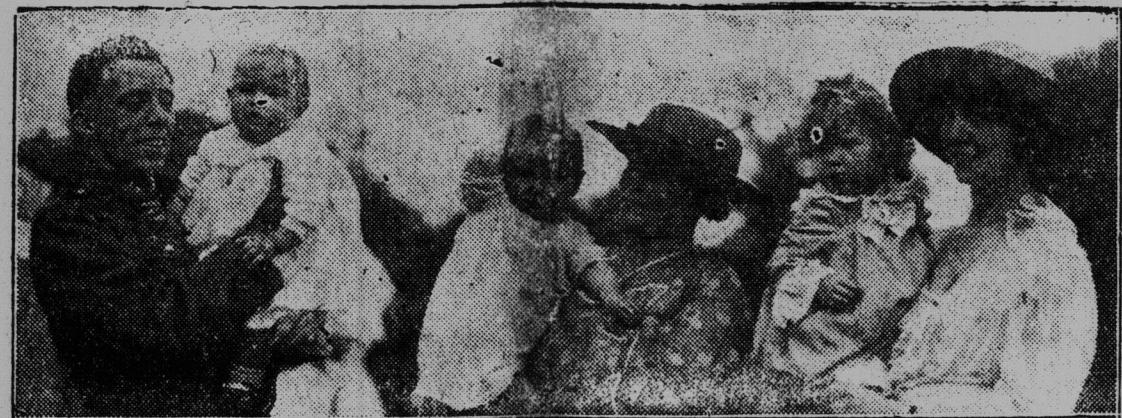
Photo shows prize winners, from left to right, first, second and third respectively taken at Baby Show at Mili-