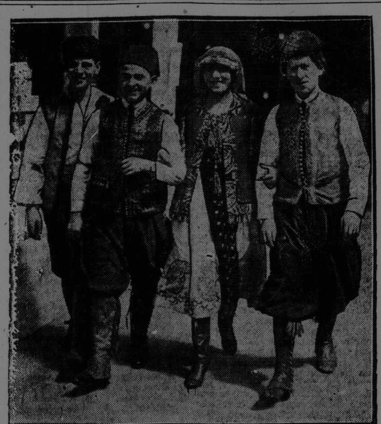
London, a few days ago.

The first step in organizing the United States navy was made in 1775.