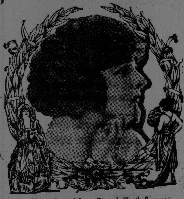
The Masterpiece of Love Eternal, Youth Supreme.