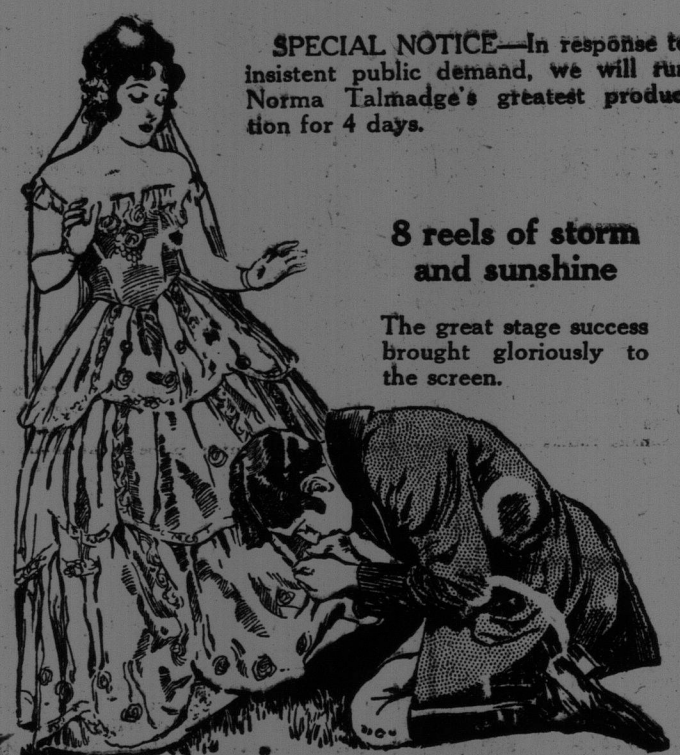
A FIRST NATIONAL ATTRACTION