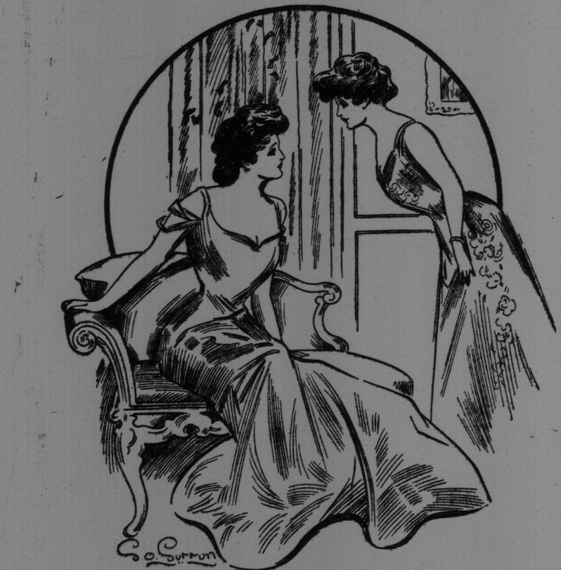
SHE WAS INNOCENT.

De Auber—How do you like my landscape? Do you think I can improve it any? Miss Cutting—You might try. You can't make it any worse!