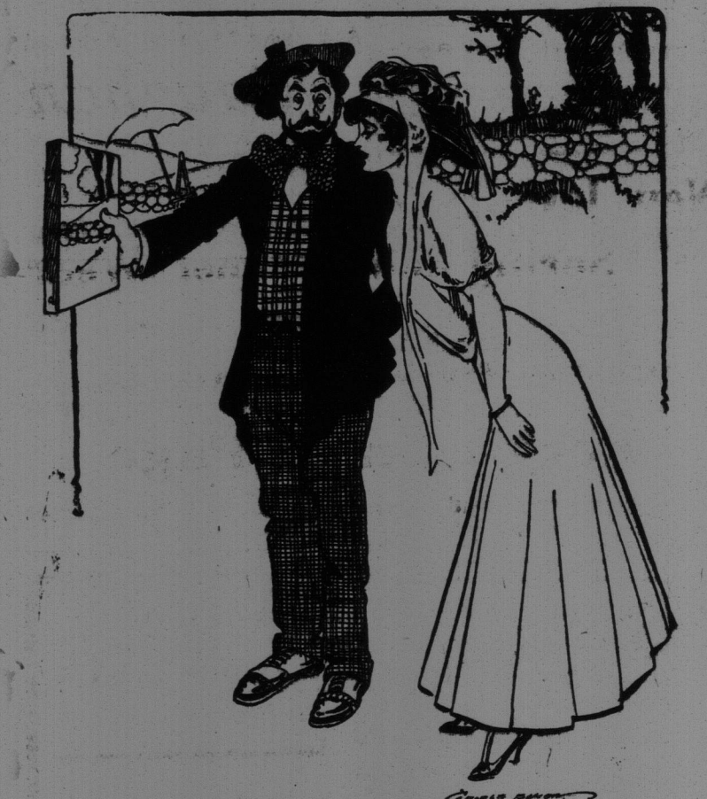
HER CANDID OPINION.