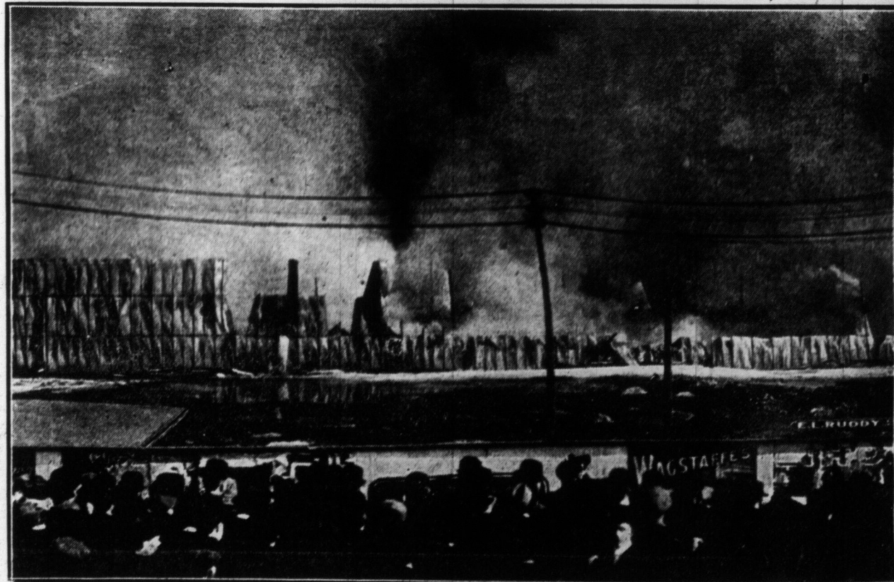
TWO HUNDRED STREET CARS, MOTORS AND TRAILERS, WERE BURNED IN MONDAY'S CONFLAGRATION.