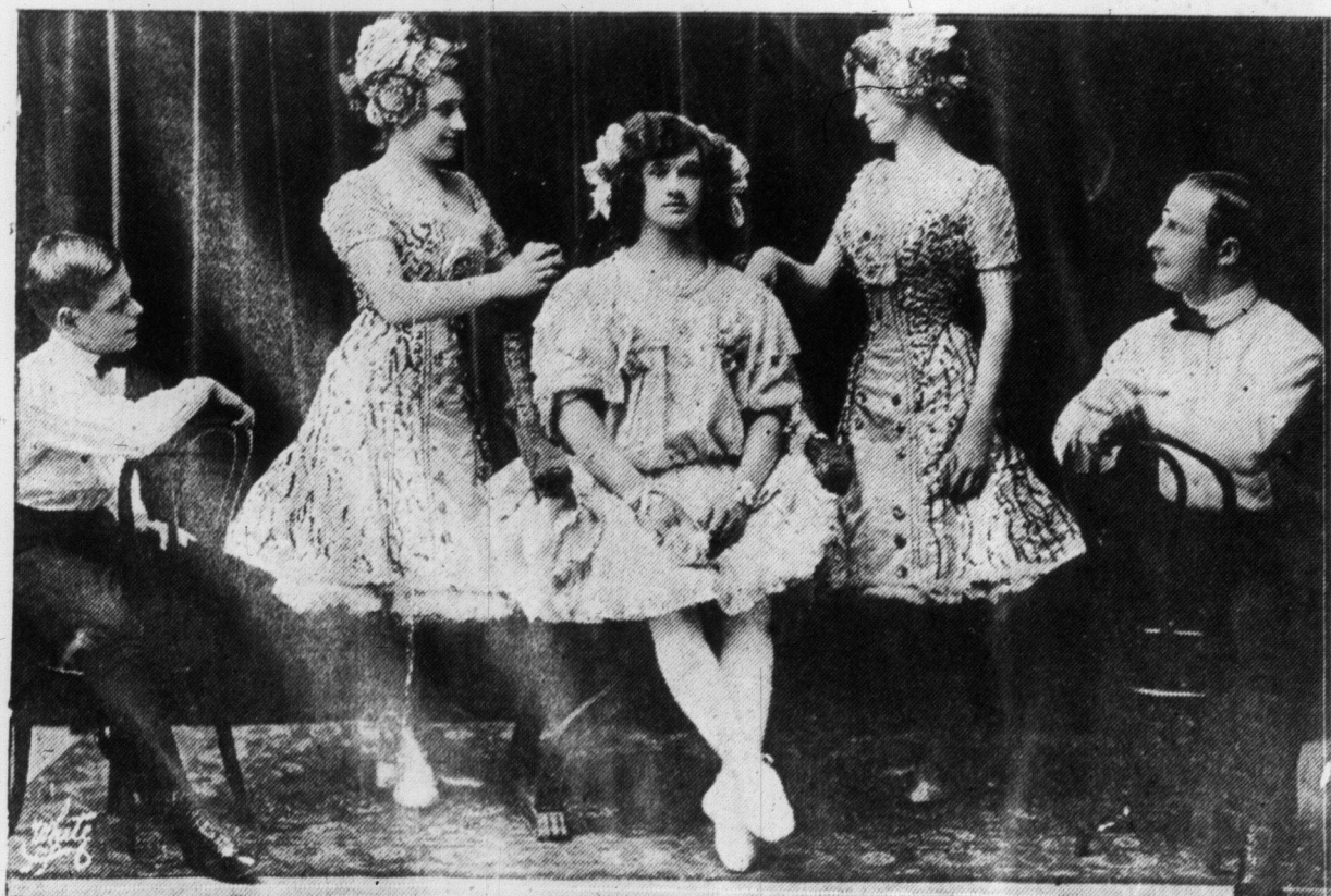
THE GREAT YOUNGMANN TROUPE, IN "HANLONS' FANTASMA," AT THE GRAND ALL THIS WEEK.