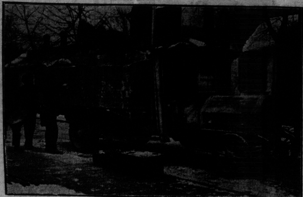
THE BIG AUTO TRUCK WHICH THE CITY IS EXPERIMENTING WITH AS A GARBAGE COLLECTOR—IT REPLACES SEVEN HORSES AND SO FAR HAS WORKED SPLENDIDLY.

United States is to be held simultaneously with the Grand Central Palace Automobile Show, and it will give New Yorkers that have never seen aeroplanes at close range an opportunity to inspect some of the world's most famous flying machines. All of the well-known makes of aeroplanes, such as the Wright Brothers, Curtiss, Love-lace-Thompson, Bleriot and other French types of biplanes and monoplanes are to be shown, in addition to many of the machines of the new manufacturers whose ideas are just coming into practical use.