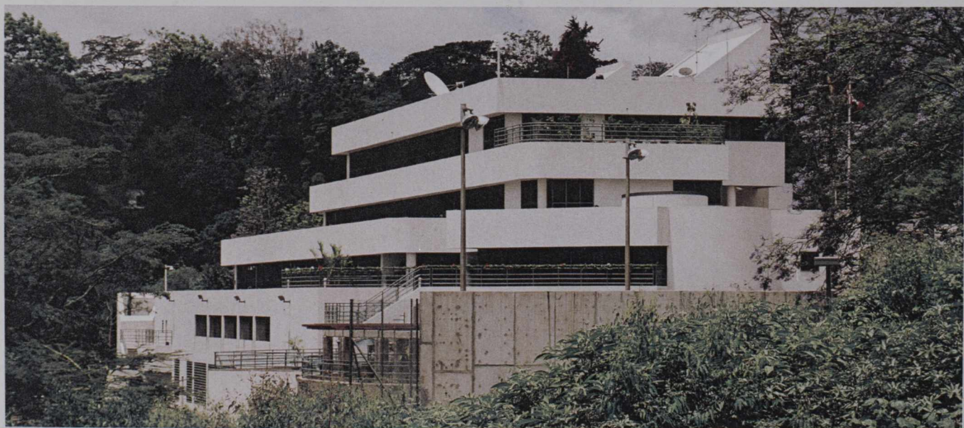
Canadian High Commission in Nairobi