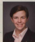
The Honourable Dr. K. Kellie Leitch Minister of Labour Minister of Status of Women