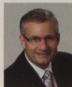
The Honourable Ed Fast Minister of International Trade

Together, we can continue to build on our momentum. We encourage you to take part in one of our trade missions, access the services offered by BWIT and the TCS, and participate in one of our 'Go Global' export workshops. We are committed to working shoulder to shoulder with you on your path to export success.