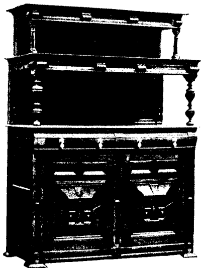
A 17th Century Welsh Cupboard Flemish Baroque Influence

HIGH CLASS FURNITURE CARPETS DRAPERIES CABINET WORK MADE TO ORDER CLUB and LODGE FURNITURE, ETC.