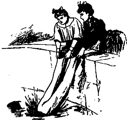
"All right! we won't let go for anything."