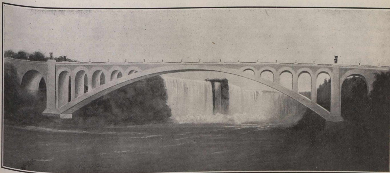
Fig. 1.—Proposed Memorial Arch Bridge at Niagara Falls.

The Niagara River is an ideal spot for such a structure on account of the prominence enjoyed by the Falls, the ease of distributing the foundations equally and the possibility of welding into its members the idea that it is an indestructible link that shall bind these two nations together for all time to come. Just at what spot the structure is to be built has not been decided, but that it will be either crossing the river close to Lake Erie or just below the Falls is very probable.