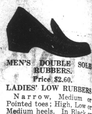
MEN'S DOUBLE SOLE RUBBERS. Price $2.60. LADIES' LOW RUBBERS Narrow, Medium or Pointed toes; High, Low or Medium heels. In Black or Tan. Price $1.30.