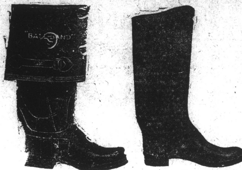
Men's Storming "Vac". Price ..$8.20