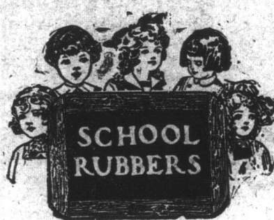
CHILD'S LONG RUBBERS . . . . $2.70