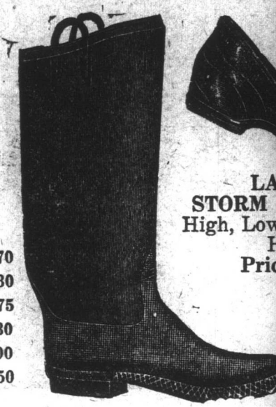
Men's Sea Rubbers