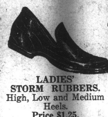
LADIES' STORM RUBBERS. High, Low and Medium Heels. Price $1.25.