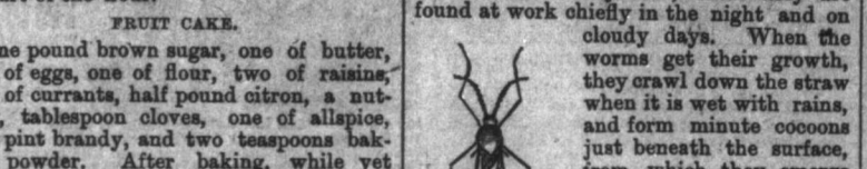
The Midon. In the perfect state, it is a small two-winged fly...