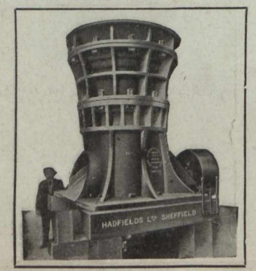
'HECLON' ROCK & ORE BREAKER