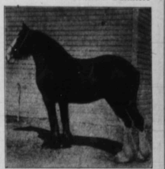
"LADY BOUNTIFUL" 15486

In the stud are females of outstanding breeding and quality, including "Lady Bountiful" (Imp.) 15488 by "Barons Pride" 9122, out of "Lily of Torr" 9199. "Queenle of Dunmore" 15842 by "Charming Boy" 2794 by "Hiawatha" 3430. The 4-year-old "Rose of Dunmore" 33340 by "Hardy Lad" 7395. The 3-year-old "May of Dunmore" 36263. "Lusitania" 41189 by "Prince Bountiful" 10216. "Edith C." 41190 and "May Bounty" by the same sire. "Pearl of Dunmore" 39255. "Proud Beauty" 19349, sire "Prince Bountiful." "Lady Strathcona" (Imp.) 19420, 22878. Sire "Baronson" 5347. Dam "Kate of Thorsk" 3638. I have also for sale some 15 head of heavy work horses, mares and geldings. All my stock are rich in the blood of "Barons Pride," one of the greatest stallions of the breed, the invincible "Hiawatha," the well-known "Woodend Gartley" and other sires which have made the Clydesdale breed famous.