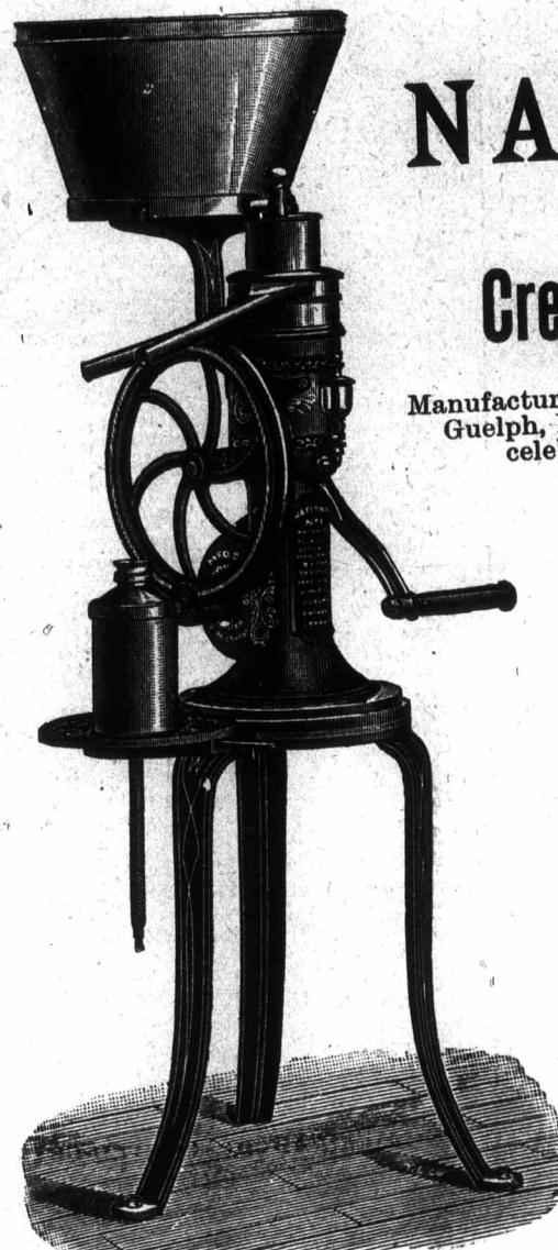
"NATIONAL" NO. 1 HAND POWER. Capacity, 330 to 350 lbs. per hour.