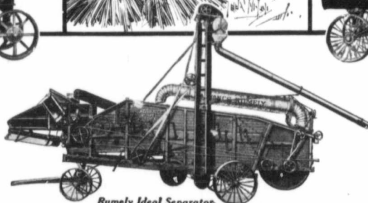
Rumely Ideal Separator.