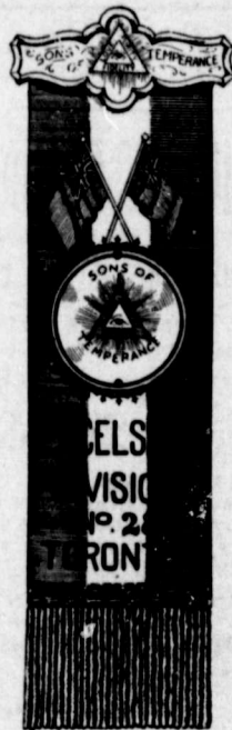
HALF-SIZE RIBBON BADGE Tricolor and Reversible if desired.