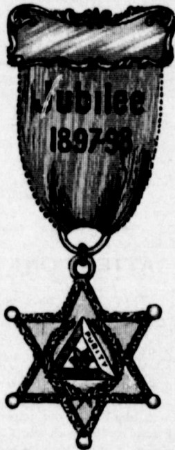
Full Size Special Jubilee Badge Heavily Gold Plated and Enamelled. Write for Special Price.

EVERYTHING SUPPLIED AT THE SHORTEST NOTICE AND AT THE LOWEST PRICES.