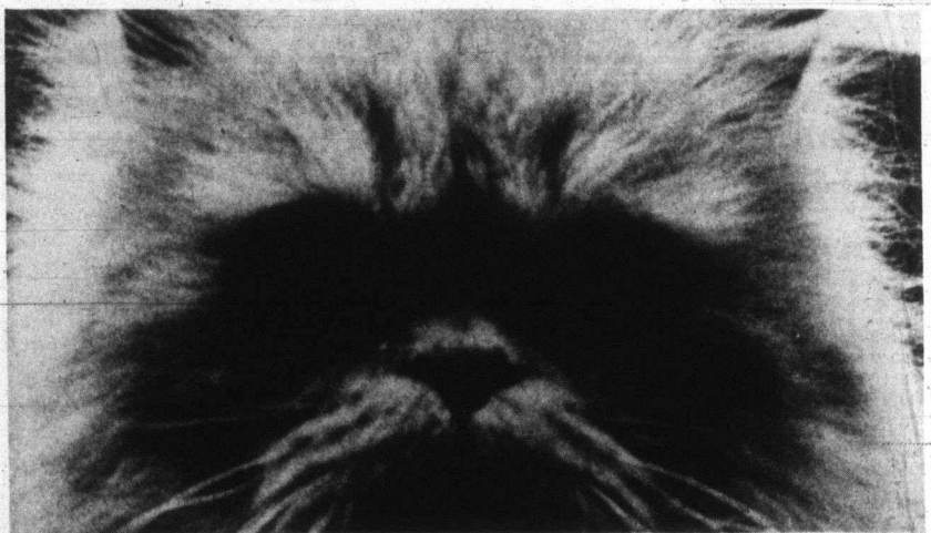
Thousands of cats and dogs are needlessly killed each year because public officials won't recognize need for public spay-neuter clinics, reader says below.

An independent newspaper published every Wednesday at 2300 South Sheridan Way, Mississauga, Ontario by Metrospan Publishing Limited. Telephone 278-0400. Single copies 15 cents, subscription per year by carrier $7.50; by mail in Canada $20; elsewhere $28. Member Canadian Community Newspapers Association. Second class mail registration number 1283.