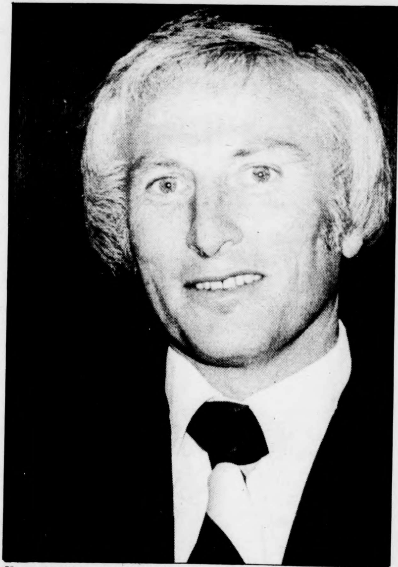
New athletic head optimistic despite obstacles.

"I want to re-enforce that I'm optimistic. The faculty and students at York and in the Physical Education program are enthusiastic. We're trying to pull in our belts without detracting from the programmes," he says.