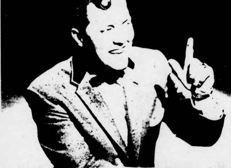
The great Bill Haley rates himself on a one to 10 scale.