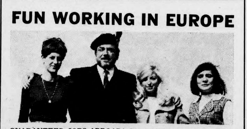
GUARANTEED JOBS ABROAD! Get paid, travel, meet people. Summer and year 'round jobs for young people 17 to 40. For illustrated magazine with complete details and applications send $1.00 to The International Student Information Service (ISIS), 133, rue Hotel des Monnaies, Brussels 6, Belgium.

Princeton - Students for a Democratic Society at Princeton announced plans for a student strike next week in an attempt to force the university to sell its holdings in 40 South African companies.