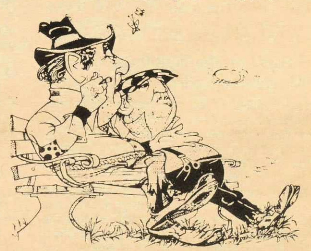
"On the other hand, inflation don't erode the value of the money we ain't got."

Ultimately women must invent new roles for themselves, roles that don't tie the knot to the house tighter, but instead free them to get a divorce from centuries of sex-stereotyping.