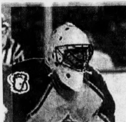
by Neil Duxbury The Brunswickan Sports

If you're looking for the hottest team in the NHL, then just look West. After being embarrassed by the upstart Devils in last year's Stanley Cup finals, the Detroit Red Wings are back. The Wings, having blazed a trail to 100 points