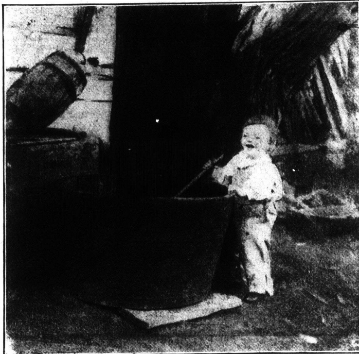
The Pet of the Farm yard.

Don't let the song go out of your life; Let it ring in the soul while here, And when you go hence it shall follow you thence And sing on in another sphere.