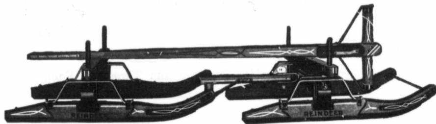
No. 28 1/2 Reindeer Sleigh

Made in all sizes with steel or cast shoes