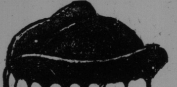
Teeth Extracted Without Pain, 15c.

Best Fancy Molasses only 33c a gallon; Tanglefoot Fly Paper, 3 double sheets for 5 cents; choice large Bananas, 15c, 2 dozen for 25c; Pure Cream Tartar only 25c pound; 2 bottles Barker's Liniment 25c; Sugar under wholesaler's prices; 8 bars Barker's Soap 25c; 1 lb. regular 40c Tea for 29c and hundreds of other articles too numerous to mention.