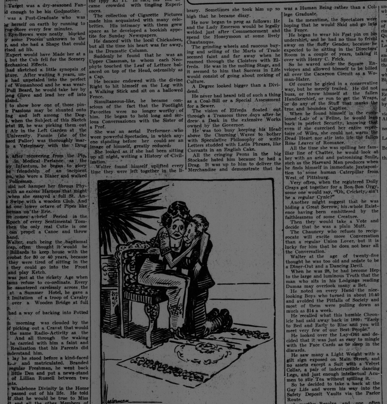
ightly profession. emotional side of his unfolding began to nourish itself on Song nd he slept each night with his lolded tightly to his Bosom. "Once a grammar school Rabbit, struggling from long trousers toward his first brier-wood pipe, had Growing Pains which he diagnosed as the pangs of True Love."