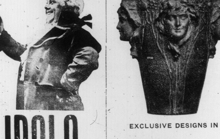
BOTTLED IN SPAIN ONLY.

ROCK CRYSTAL Try a glass of GONZALES . & BYASS' IDOLO SECO SHERRY, ELECTROLIERS then you will know the kind to call for when you want THE BEST.