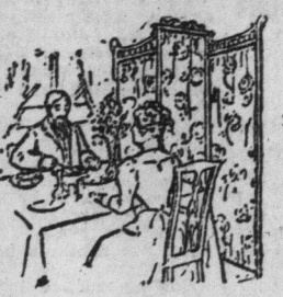
Table Linens—Reduced Prices. 72-in. Double Damask, full bleach, extra heavy quality, Irish and

Scotch make. pure linen, extra fine satin finish, choice new pat-15 dozen Plain Irish Linen Hem-