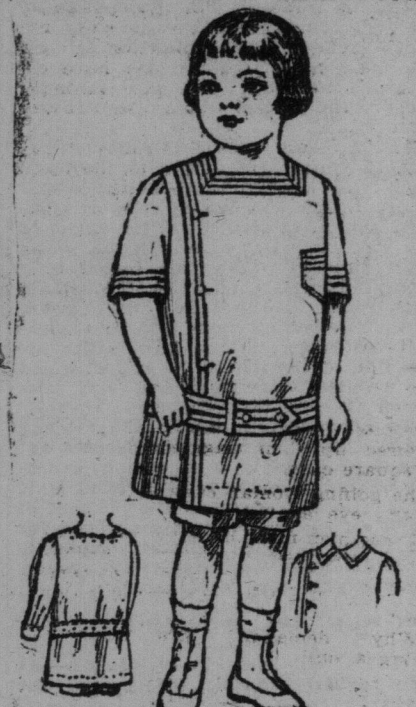
7883 Boy's Russian Blouse Suit, 2 to 6 years.

WITH SQUARE OR HIGH NECK, SHORT OR LONG SLEEVES. For the 4 year size the suit will require 2 3-8 yards of material 27, 2 5-8 yards 36 or 1 7-8 yards 44 inches wide, with 14 yards of braid. The pattern of the suit, 7883, is cut in size for boys from 2 to 6 years of age. It will be mailed to any address if the fashion department of this paper on receipt of 15 cents.