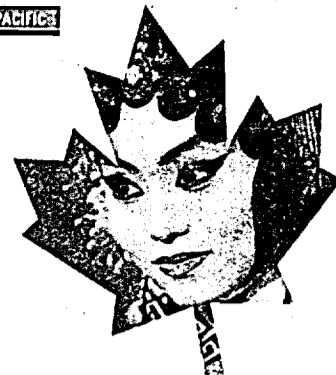
Cantonese Opera Star