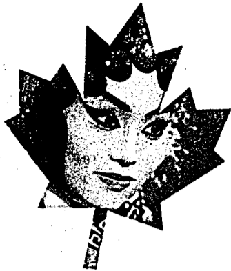
Cantonese Opera Star

L'ANNÉE CANADIENNE DE L'ASIE-PACIFIQUE CANADA'S YEAR OF ASIA PACIFIC