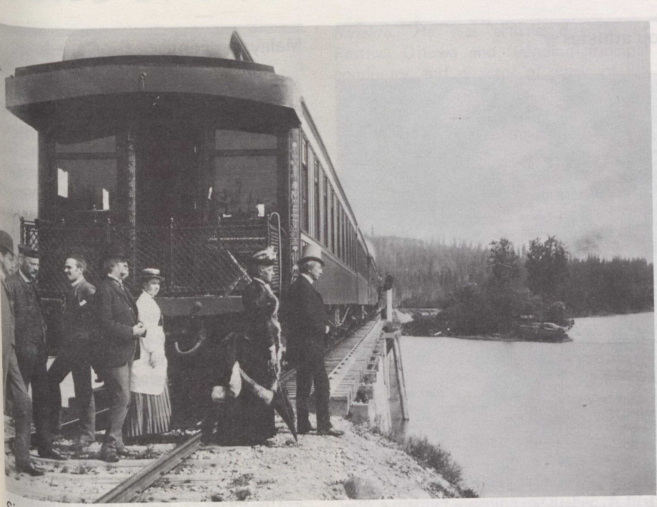
Sir John A. and Lady Macdonald at Stave River, British Columbia. All his life he pur-Sued a dream of a continental nation bound together by the Canadian Pacific Railway.

In his new government Macdonald doubled as Prime Minister and Minister of Indian Affairs, and there is clear evidence that in the latter capacity he neglected his duties. The procrastination which had earned him the nickname "Old Tomor-"ow" reaped a bloody harvest in the