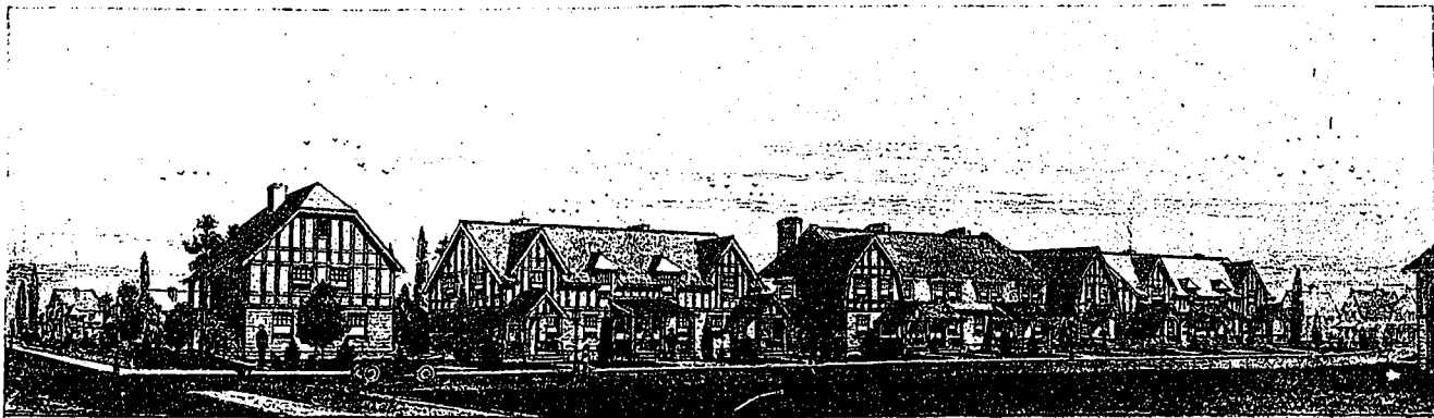
PERSPECTIVE OF NORTH FRONT, COURT NO. 2, RE-HOUSING DEVELOPMENT, HALIFAX, N.S.

an Appraisal Board appointed for this purpose. Faced with the necessity of interviewing each individual householder who had lost his home, ascertaining his requirements and providing a plan to meet the individual need at reasonable cost of reconstruction, was a task requiring considerable patience and time. In the meantime it was found essential to immediately house as many families as possible in more permanent structures than those provided for temporary relief, and it was realized that this could only be accomplished by the rapid construction of some four hundred dwellings of varied design and accommodation. For this purpose, a suit-