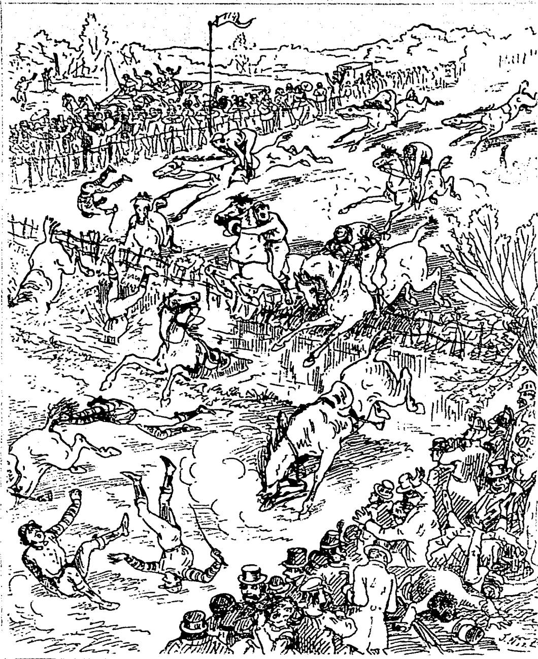
A RACE WITH HEELS.