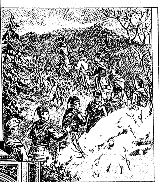
TOWARD THE PINES.