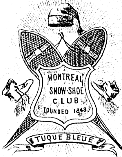
COAT OF ARMS M.S.S.C.