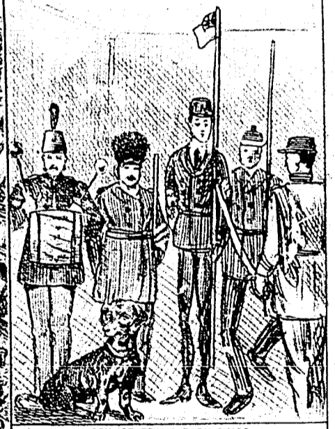
GOV.-GENERAL'S BODY GUARD.