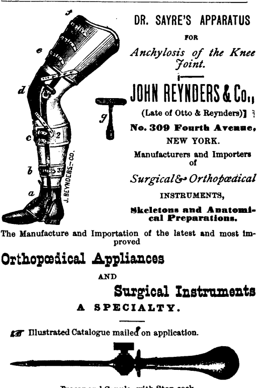
Trocar and Canula, with Stop-cock.