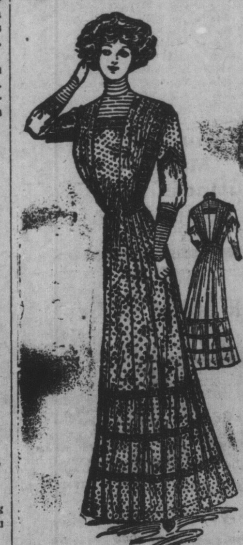
A SEMI-PRINCESS COUTURE IN FOULARD.

Some of the new lingerie dresses are charming. They are shown over tulle silk slips in the prettiest shades. On some of them are girdles and deep bands of colored silk. Even the elaborate