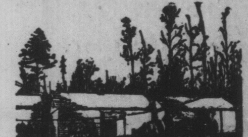
Shack Life at Muskoka Free Hospital for Consumptives.

The trial was the severest in the history of these Muskoka Homes, in which nearly 3,000 persons, stricken by the dread white plague, have been cared for.