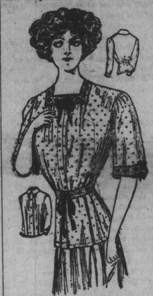
SMART BREAKFAST JACKET.

Practically all of the tailored suits carry plaited skirts in some form. There are many new styles in tunic or half draperies over plaited founces.