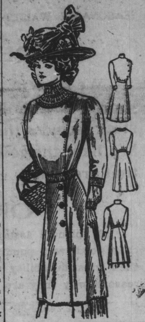
MINNIE'S ROUSSEAU BLOUSE COAT.

A New Button For Outdoor Wraps. Belts of Chamolite Leather. There is a new button for outdoor garments made of wood. It is initial, stained and polished in beautiful colors and harmonious designs. On some of the extra large turbans there has come about a fashion of using a border of small feathers. These are substituted for fur and are an advance style of the spring turbans. A four inch band of tiny white tips is used on a black panne velvet turban, with a turquoise and crystal cabochon at left front. The reverse of this style is a narrow band of black tips used on a white beaver. The belts of chamolite, dyed to match the costume of cloth or velvet, are the choice just now of the smart girl. A