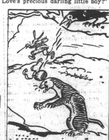
Old Grandmother Magple dropped her vanity bag kerplunk!

lollypops, which rattled merrily as he "I did, you wicked person," screamwent clipperty, clip lipperty lip over ed Grandmother Magpie, flapping her