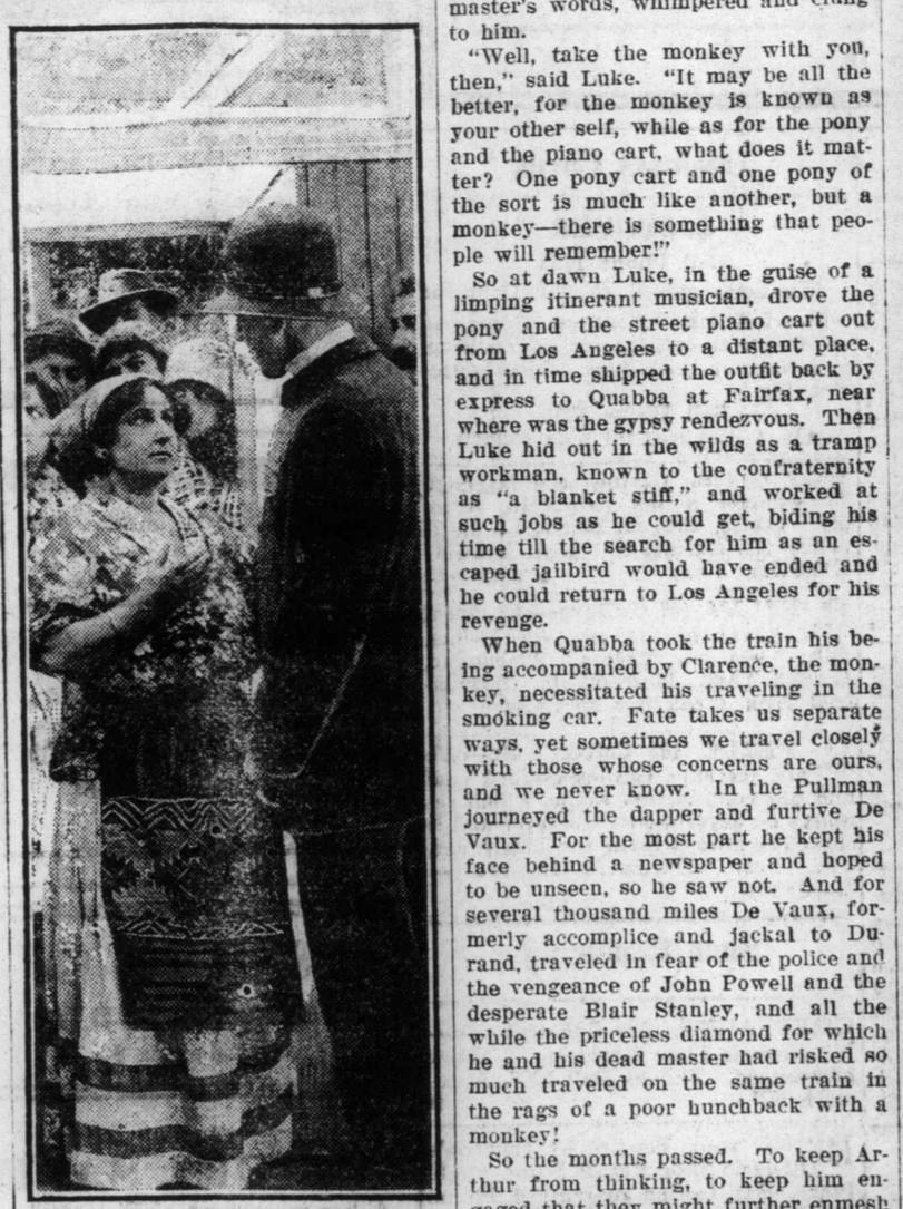
The Signora Solari Explained to the Police.

the Solari establishment the signora had quieted at the counsel of her more composed daughter. They explained to the police that there had been a quarrel between two of the patrons, a quarrel that had greatly alarmed the signora and her daughter, since that, as the gentlemen of the police knew, was a most respectable place! They were not regular patrons who had caused such an unseemly disturbance, the signora further explained. Happily, as the gentlemen of the police knew so well, the Cafe La Bella Napoli would not tolerate custom of this kind. The disturbers were gone. They had