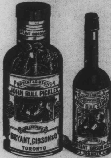
This is a facsimile of our bottles.

BRYANT, GIBSON & Co., TORONTO, Manufacturers of