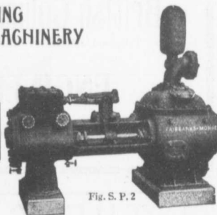
Fig. S. P. 2

The Canadian Fairbanks Co., Limited MONTREAL TORONTO WINNIPEG VANCOUVER